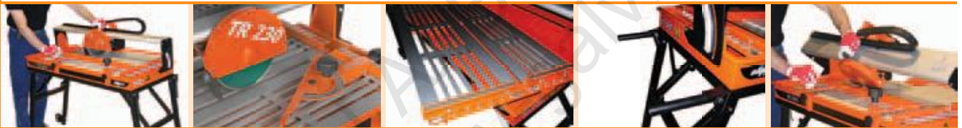
Cutting guide with angular setting

TR230GS is a professional tile saws with powerful motor (1,1kW) and cutting length adapted to large tiles (860mm).